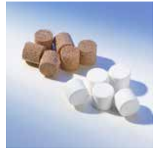
Hydrophobic and oleophobic top coatings available