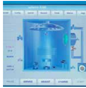
Easy to operate with a user-friendly touch screen