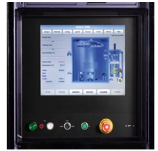
User-friendly HMI software