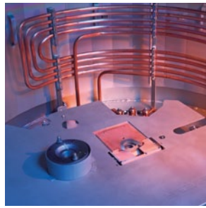
Larger Meissner trap