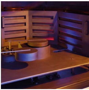
Intelligent movable shields