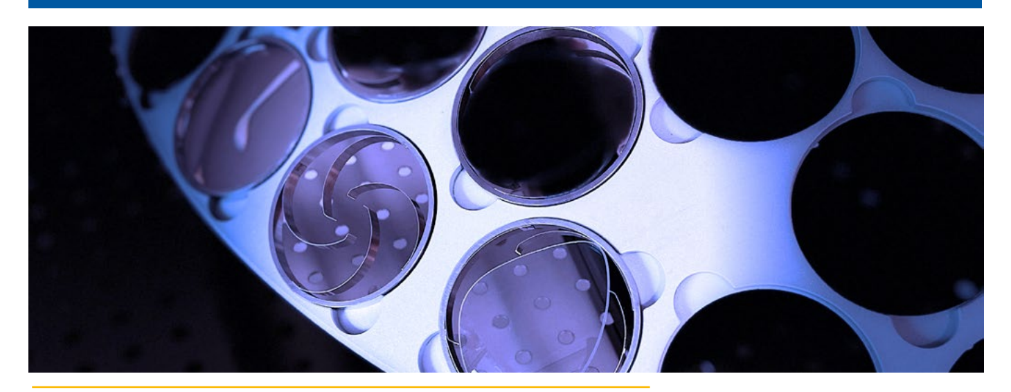
Revolutionary sector dome design can accommodate different sector types at once: sector and standard rings with slim rings