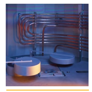
Larger Meissner Trap higher throughput