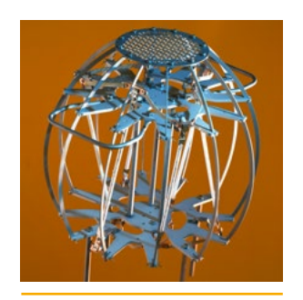
Portable degassing system.