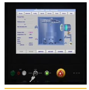
User-friendly HMI software.