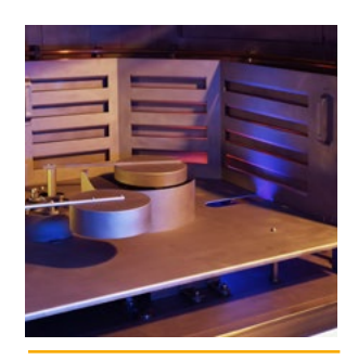
Intelligent movable shields optimizes pumping speed.